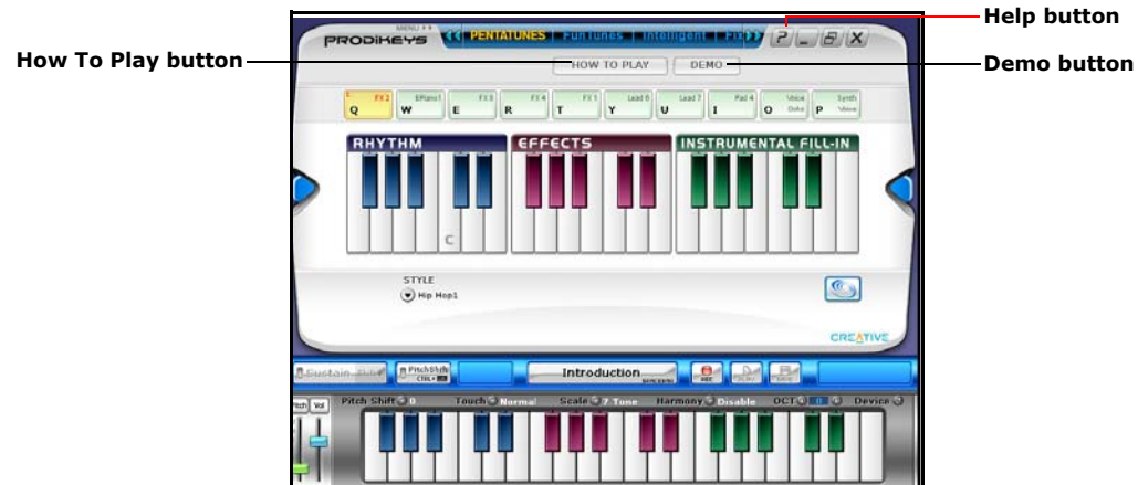
Figure 3-2: Creative Prodikeys DM software startup screen — Pentatunes mode

After launching the software, you should see a screen similar to Figure 3-2.