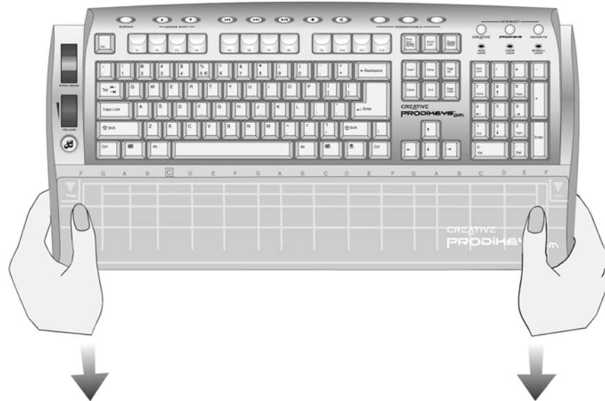
Figure 1-2: Removing the palm rest.

To remove the palm rest: Press down the upper corners of the cover and slide it out, as shown below.