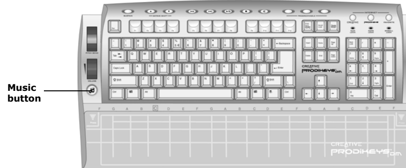
Figure 3-1: Creative Prodikeys DM keyboard.

To start the software: Press the Music button on the Creative Prodikeys DM keyboard.